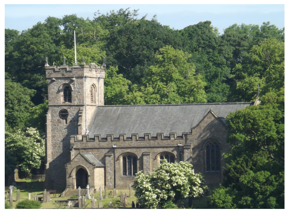
INFORMATION CORRECT NOVEMBER 2015