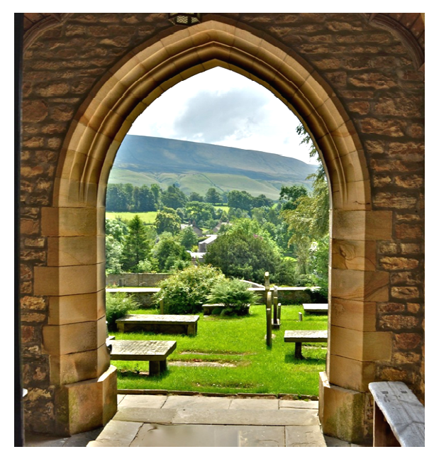
St Leonard's on the web www.downhamvillage.org.uk

or the St Mary's Parish Office on admin@stmaryclitheroe.com 01200 422828